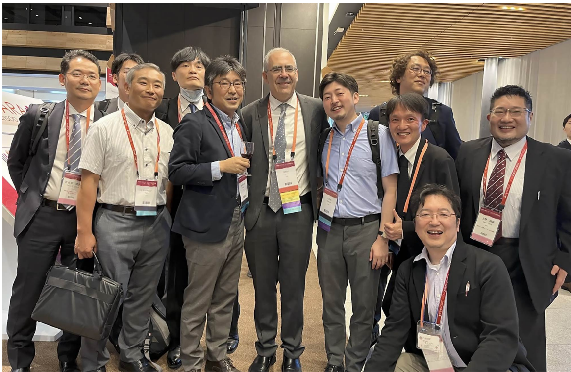
A memory from Nara Meeting with colleagues from Japanese Association of Oral Supportive Care in Cancer (JAOSCC)