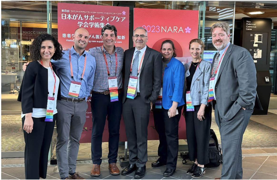
Our new board had it is first face-to-face meeting in Nara, Japan. MASCC/JASCC/ISOO Annual Meeting 2023.